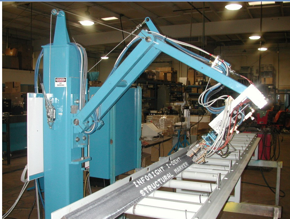
Typical Structural Shape Marking System