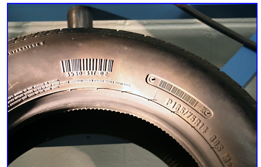
Tire being read by the Smart-Camera