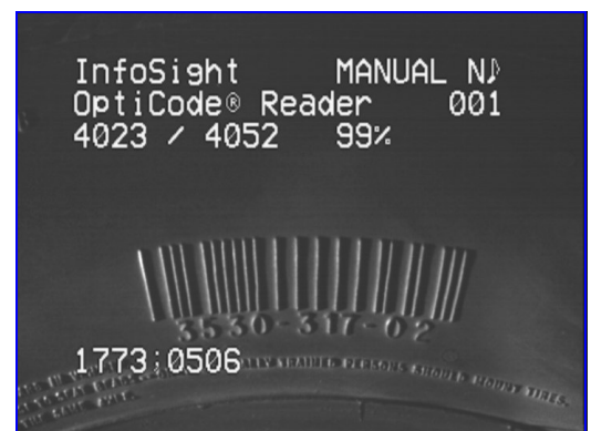
Screen Shot of tire

Code 128, Code 39 Interleaved 2 of 5 EAN-13 / UPC-A Custom Binary Codes (InfoSight)