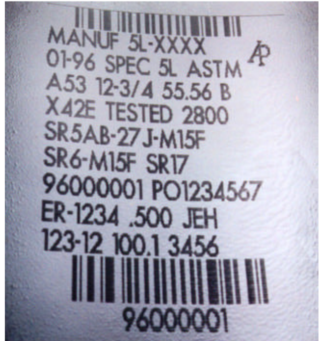
Typical API pipe identification on pipe I.D. or O.D.

For many types of products, traditional adhesive backed labels or the attachment of barcode tags is not practical in many cases. All too often, the surface roughness, temperature, fluids and solvents used in industry will adversely affect the bonding of adhesive labels and tags.