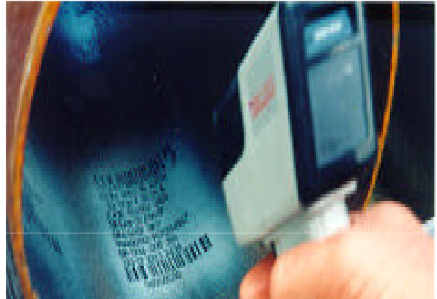
Standard bar code portable reading gun.

The third and final step in the marking process is the laser marking of the paint patch. The system software receives the label data from a pre-configured application, operator interface terminal or a host computer interface. This information is used to drive the focused CO laser to mark a high contrast, high-resolution indicia into the paint patch.