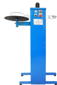
Labelase 2800 Family High Speed & Harsh Environments