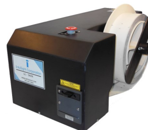
Labelase 3000 More Tags in Less Time