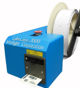
Labelase 1000 The Industry Standard