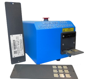
Labelase 1000P Custom ID Tags for Finished Products