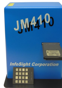
Labelase JM410 Mid-Volume Value